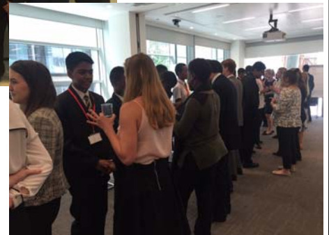
Top: students at KPMG and right meeting staff at Pinsent Masons